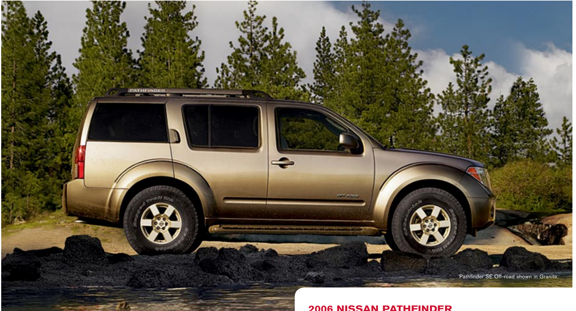
Pathfinder SE Off-road shown in Granite.