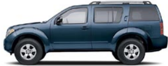
S: READY FOR ADVENTURE