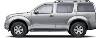
SE OFF-ROAD: TOUGH AND RUGGED